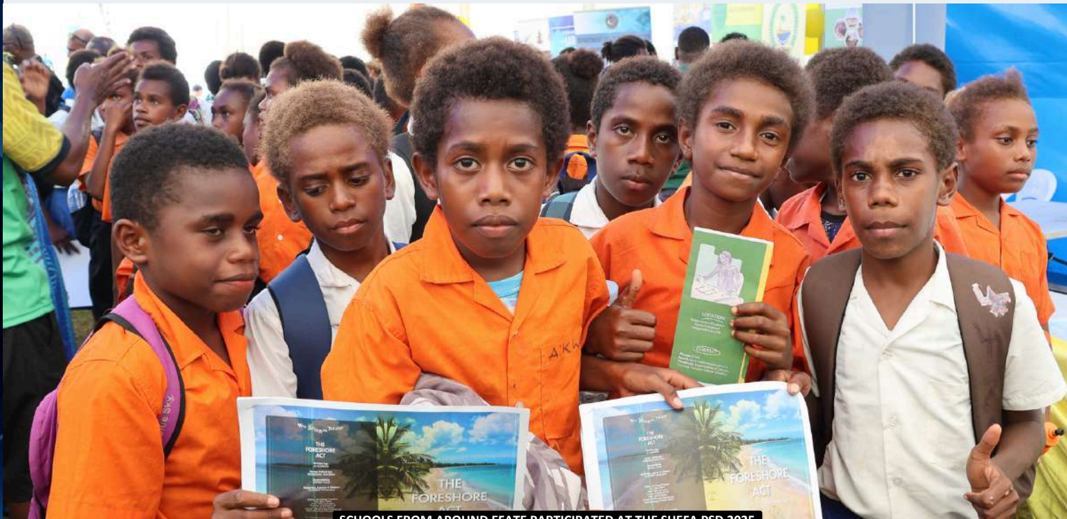
SCHOOLS FROM AROUND EFATE PARTICIPATED AT THE SHEFA PSD 2025

PSC Day 2025 — Comprehensive National Activity Report February 2026