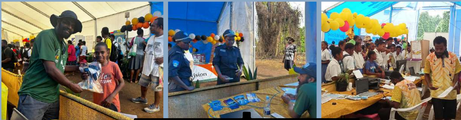
GOVERNMENT MINISTRY BOOTHS AND COMMUNITY ENGAGEMENT AT GAUA