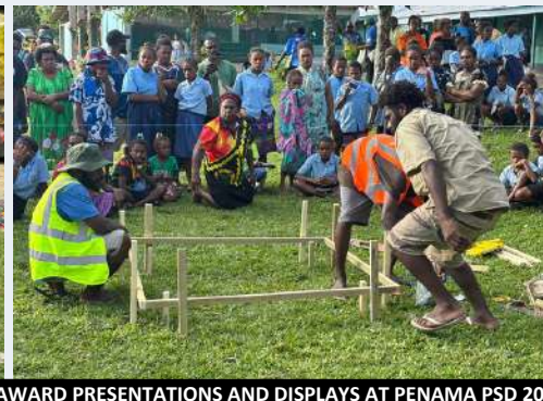
AWARD PRESENTATIONS AND DISPLAYS AT PENAMA PSD 2025