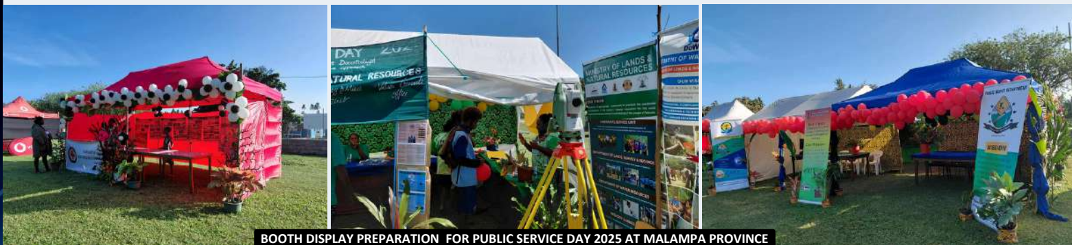
BOOTH DISPLAY PREPARATION FOR PUBLIC SERVICE DAY 2025 AT MALAMPA PROVINCE