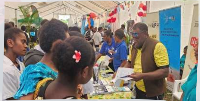
MINISTRY OF THE PRIME MINISTER & MINISTRY OF FINANCE AWARENESS TO STUDENTS AND PUBLIC