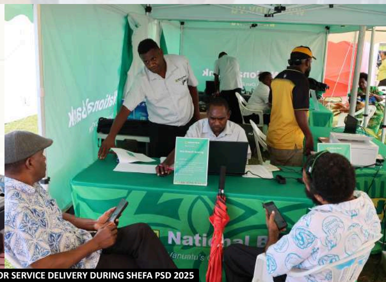
PUBLIC SECTOR AND PRIVATE SECTOR SERVICE DELIVERY DURING SHEFA PSD 2025