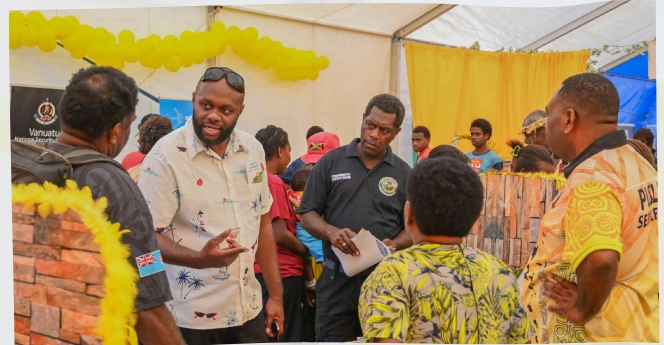
STUDENTS AND COMMUNITY MEMBERS ENGAGING WITH MINISTRY BOOTHS