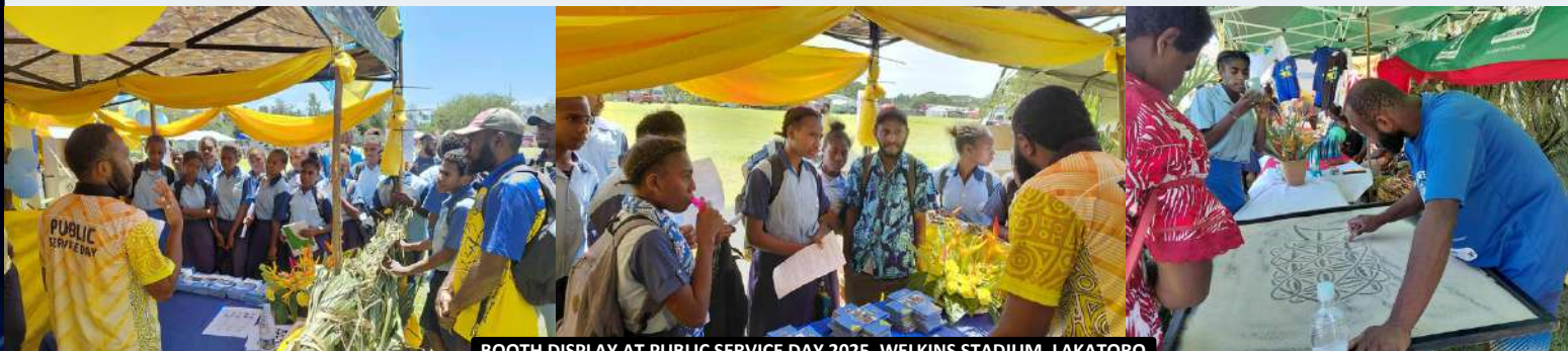
BOOTH DISPLAY AT PUBLIC SERVICE DAY 2025, WELKINS STADIUM, LAKATORO

Network connectivity limitations affected event communications; advance engagement with Digicel and Vodafone is recommended. Weather challenged sea travel for participants; backup travel arrangements should be built into planning. Limited booth and decoration materials should be budgeted earlier. Accommodation communication gaps should be addressed through clearer LOC-provider coordination.