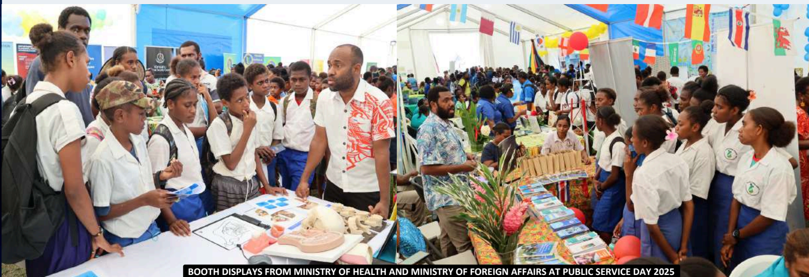
BOOTH DISPLAYS FROM MINISTRY OF HEALTH AND MINISTRY OF FOREIGN AFFAIRS AT PUBLIC SERVICE DAY 2025