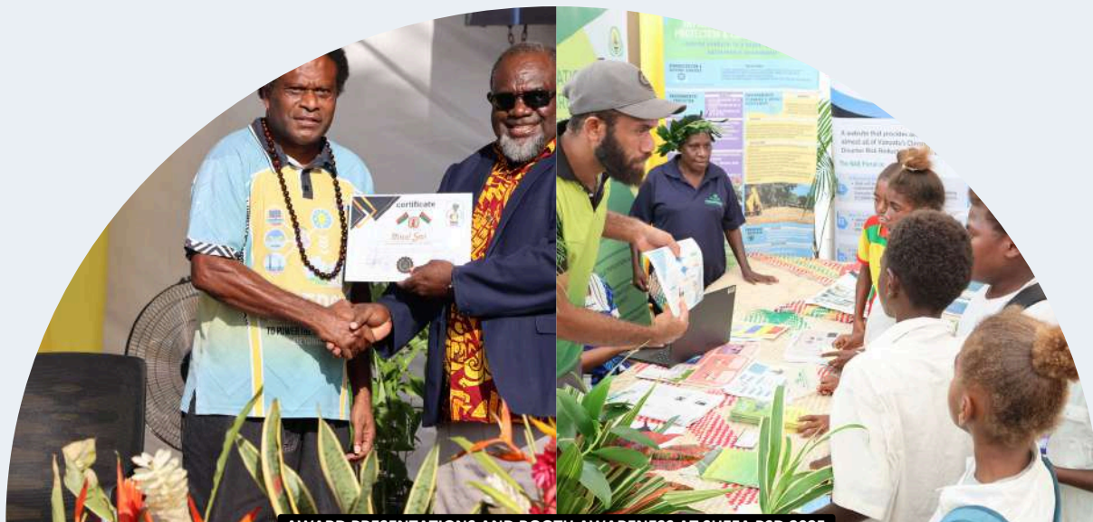
AWARD PRESENTATIONS AND BOOTH AWARENESS AT SHEFA PSD 2025