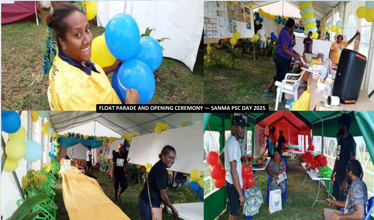
FLOAT PARADE AND OPENING CEREMONY — SANMA PSC DAY 2025