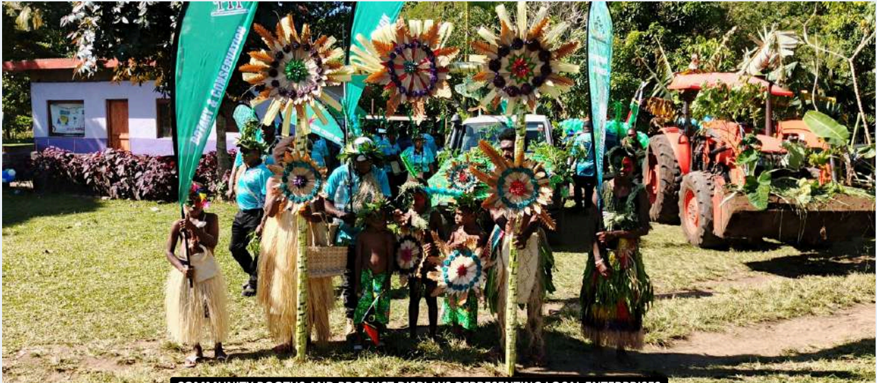
COMMUNITY BOOTHS AND PRODUCT DISPLAYS REPRESENTING LOCAL ENTERPRISES